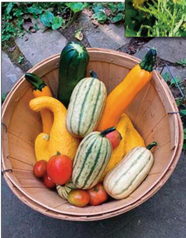
First fruits for the foodbank.